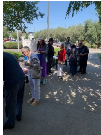
Enjoying a quick chat during Coffee Hour