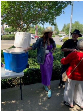
A quick chat while managing the frozen treats.

Special thanks go out to the volunteers who helped with setup, refreshments, and cleanup. Your efforts made the day extra special!