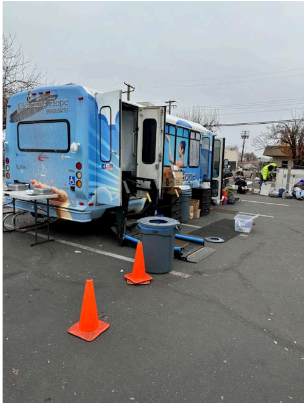
Shower Shuttle – Ready for Clients