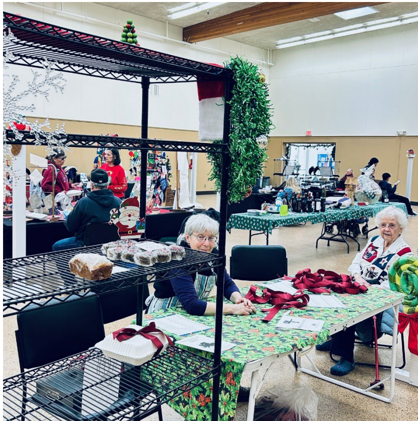
Waiting to tie the Bow