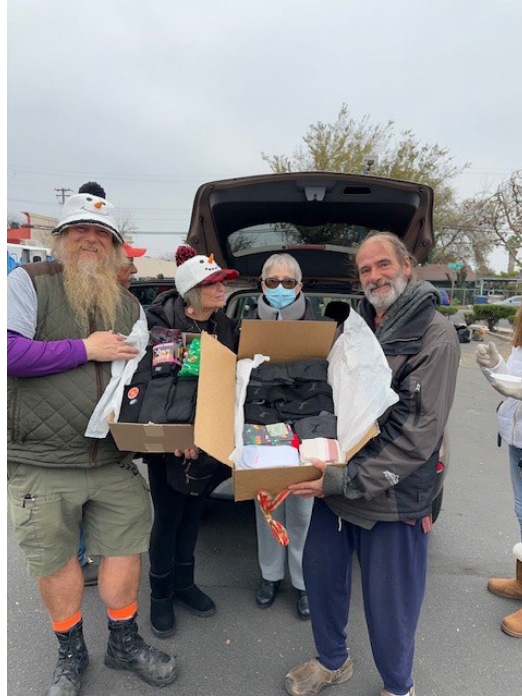
Shower Shuttle Sock Delivery