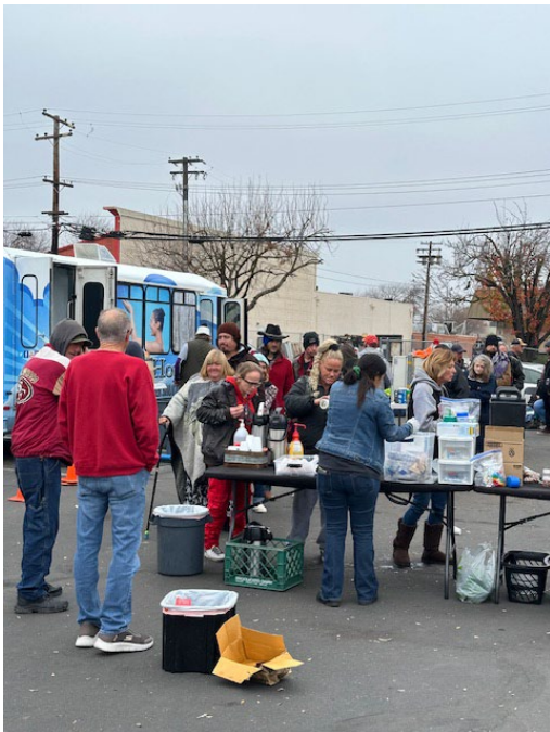
Shower Shuttle Clients