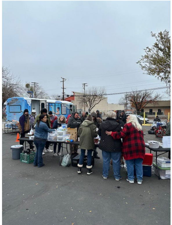
Shower Shuttle Open