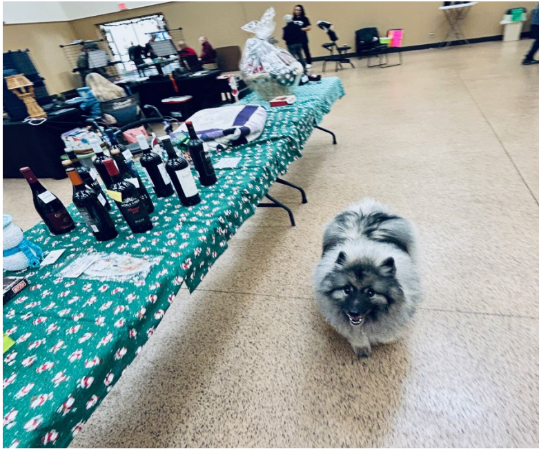
Raffle Prizes and Wicket