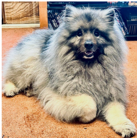
Wicket, adjusting to the change as well.