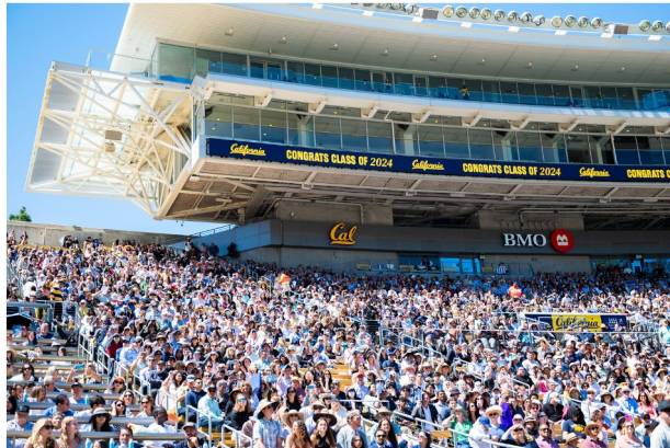
Picture taken from UC Berkeley graduation 2024

The UC Berkeley 2024 graduation ceremony was a memorable and joyous occasion, marking the culmination of years of hard work and dedication by the students. Held at the renowned Zellerbach Hall, the ceremony celebrated the achievements of graduates across various disciplines.