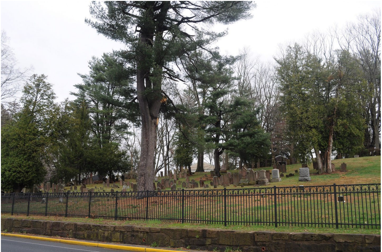
Cemetery in Middletown CT